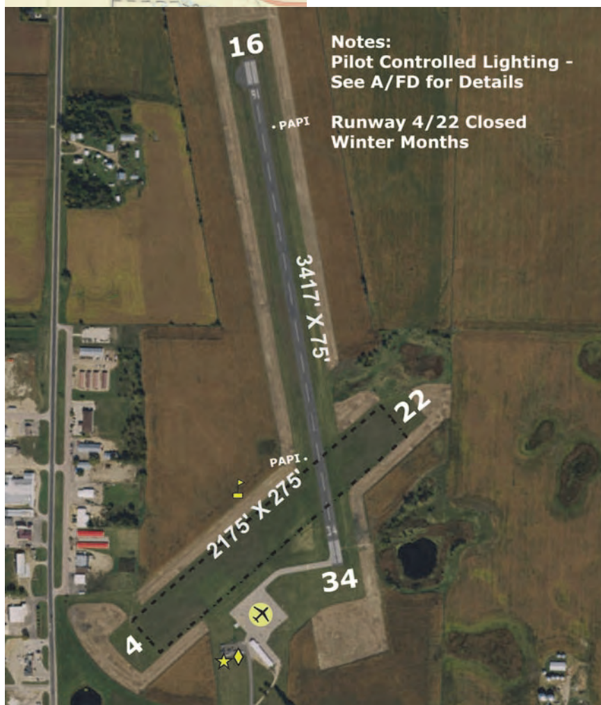
Ortonville Municipal Airport - Martinson Field